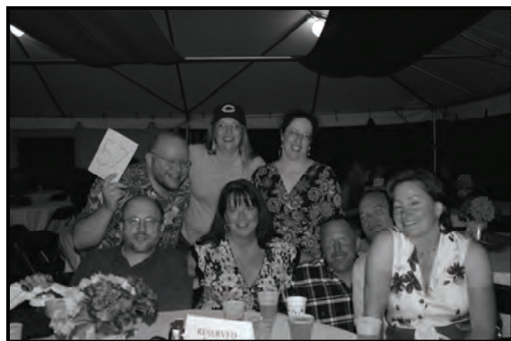
What a better way to spend an evening with friends!

As people strolled into the party, our Black Tie & Blue Jean theme seemed to add an extra flare to the event right from the start. Looking into the crowd you could find top hat and tails, beautiful dresses, blue jeans, boots and everything in between! When a stretch limo showed up and the doors opened to a table of eight already in song, we knew it was going to be an exceptional evening!