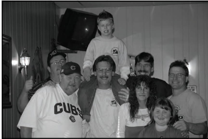
Our High Money Winners