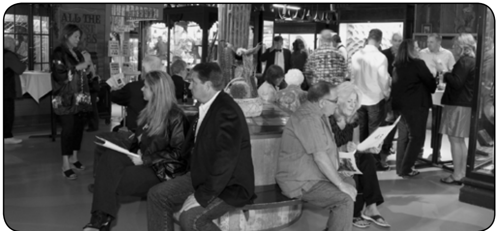
Guests enjoy cocktails in the museum.

Please mark your calendar for our celebration of Main Stay's 25th year on May 4, 2012