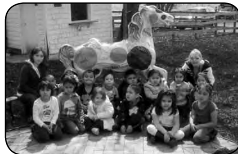
Above: Spring session of HeadStart.

Main Stay was the recipient of a very generous grant from the Mary E. Gardner Foundation which they awarded during their spring grant-making cycle. The foundation granted our request for a new tractor to replace our old one that had become obsolete along with a grant to purchase horses. On top of this, they also provided funding for spring and summer programming for Head Start, The Child Advocacy Center for McHenry County, AND a group of at-risk teens from the Lake County Mental Health Department. We are so very grateful for their significant and continued support—my oh my, oh my!