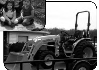
Right: Our shiny new tractor.